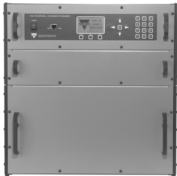
Controller with Model A2-EC Expansion Cabinets

115 or 230VAC with optional external "line lump" power supply (15VDC output). Will also work from a 12V battery with reduced specifications.